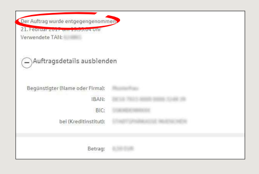
Tips for step 3: Enter the details directly. Errors can occur when copying. Avoid using umlauts and special characters. Euro and cents are separated with a comma. Avoid using any separator for thousand amounts.

6 Your transfer has been carried out and you receive confirmation.